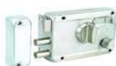
XM701-SS RIM LOCK