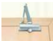
N8803 - Surface Mounted Door Closer