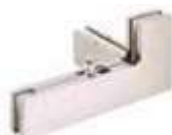
UP-041R / UP-041L - Patch for Over Panel