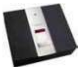
Safe - 3000 Series - eU-JUESF3001-AT