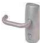
OAD805N - Outside Access Device