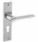
5000BP02 - 5000 Series; Berlin