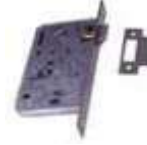
906PL - Mortice Latch