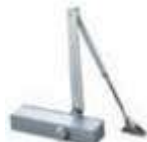
ES100 Series - Surface Mounted Door Closer