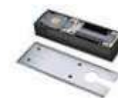
FS75B - Double Action Floor Spring