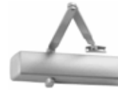
8715 - Heavy Duty with Back Check