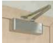
N8824 / N8824BC - Medium Duty