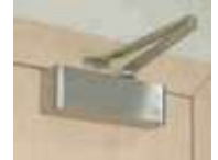
N8826 - Heavy Duty