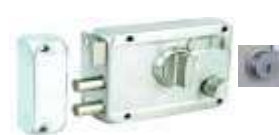
XM-702-SS RIM LOCK