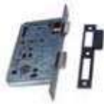
906TA - Mortice Bathroom Lock