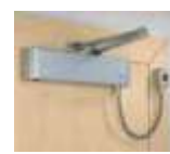
N8899 - Hold Open and Swing Free