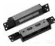
MMSH - Mortice Mounted Shearmagnet