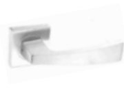
5000SRS03 - 5000 Series; London