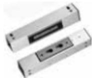
SMSh - Surface Mounted Shearmagnet