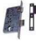
906PZ - Euro Profile Mortice Lock