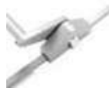
882 / 882L - 2/3 Point Locking Push Bar Panic Device