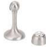
X8400-Magnetic Door Holder