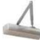
8726 - Heavy Duty with Back Check