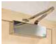
N8825 - Heavy Duty with Back Check