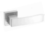
5000SRS01 - 5000 Series; Rome