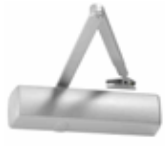
8735 - Rack & Pinion Door Closer