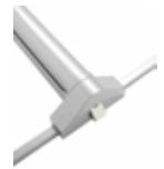
882T / 882TL - 2/3 Point Locking Touch Bar Panic Device