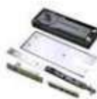
FS200E Series - Double Action Floor Spring