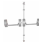
PD802N - Double Rebated Door Panic Set