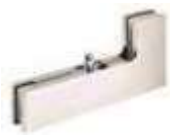
UP-040 - Top Patch for Over Side Panel