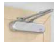
N8834 - Medium Duty