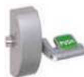
EPL804N - Single Door Emergency Push Pad Latch