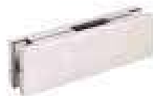
UPS-050 - Universal Strike Box