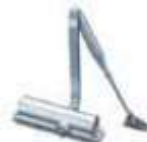
88234 - Surface Mounted Door Closer