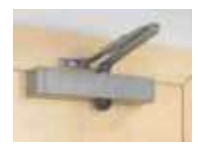
Retro3 & Retro4 - The ideal retro-fit solution