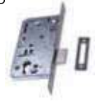
906DL - Euro Profile Mortice Deadlock