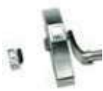
1910 - Rim Model