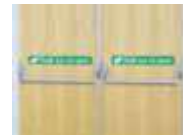
883 / 883-W - Double Rebated Door Set