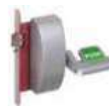
EM807N - Emergency Push Pad Mortice Operator